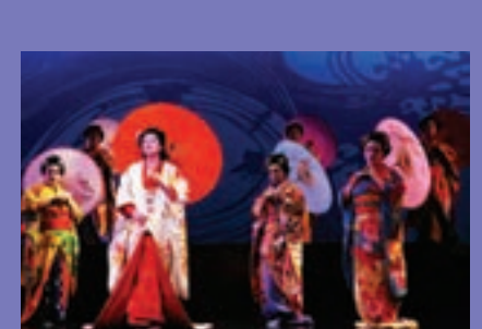
NOTABLE EVENTS: Cinequest Film Festival 24,