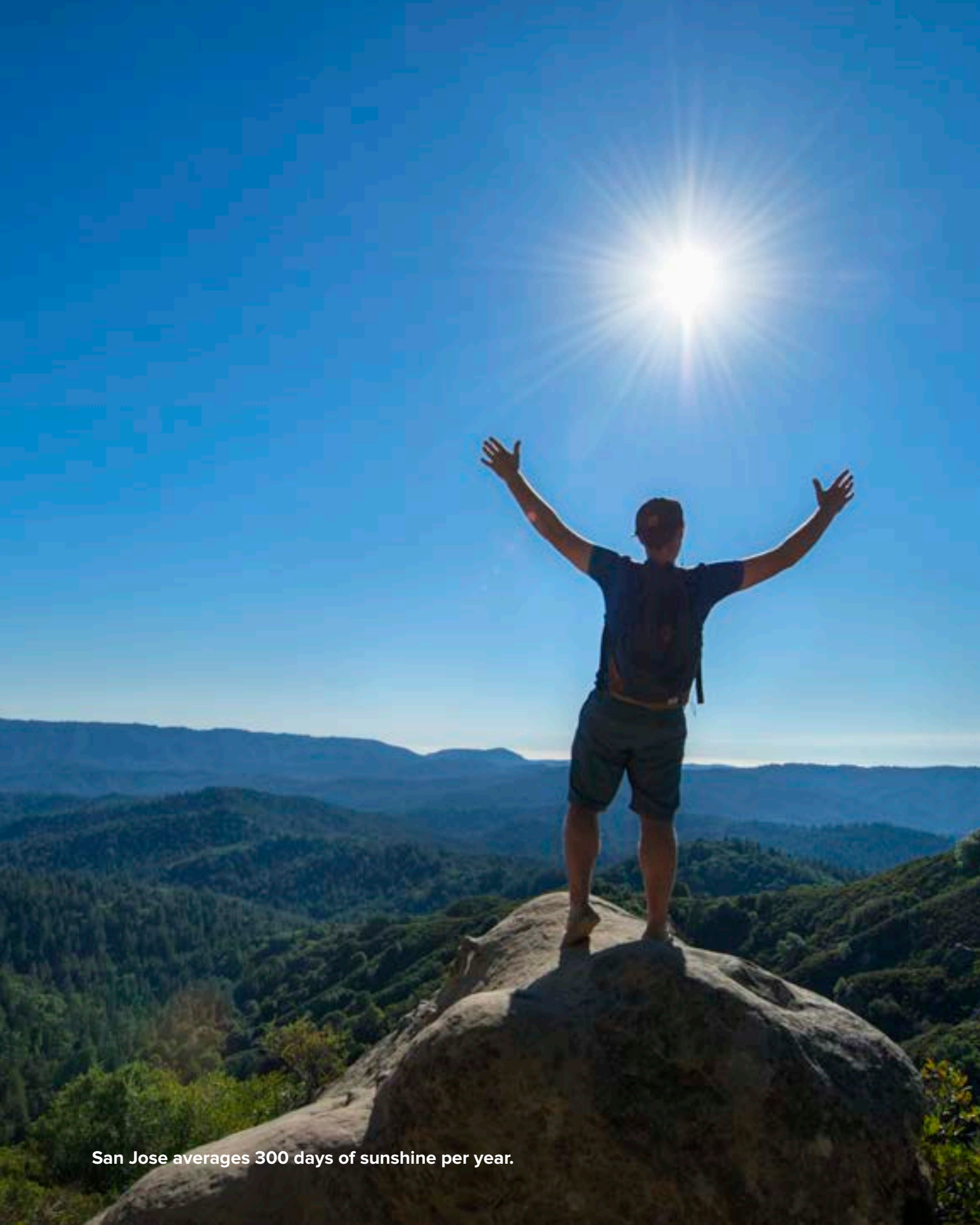
San Jose averages 300 days of sunshine per year.